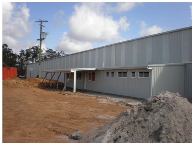
Office, lunchroom & toilet block from exterior