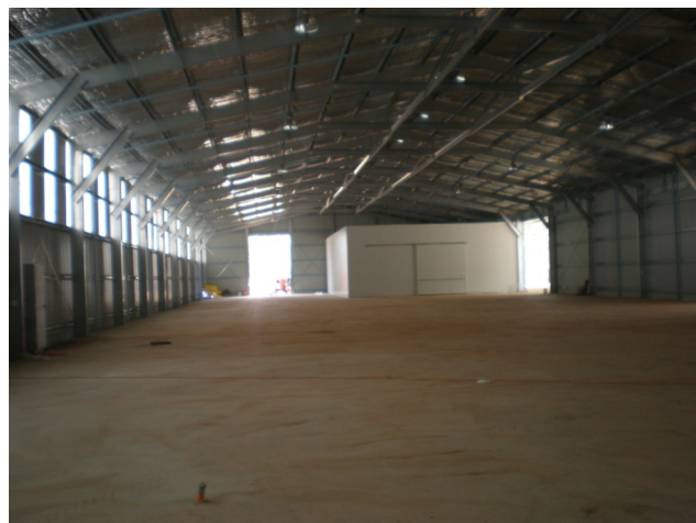
Shed interior with pallet coolroom at the far end

At this stage we are hoping to trial the shed in late September ready for your fruit to begin arriving in October.